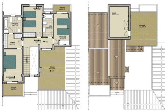
VIVIENDA 105 Y 108 | ORIENTACION OESTE | PLANTA PRIMERA Y CUBIERTA | ESCALA 1:300